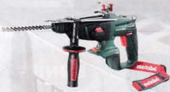
3 Mode SDS Plus Rotary Hammer