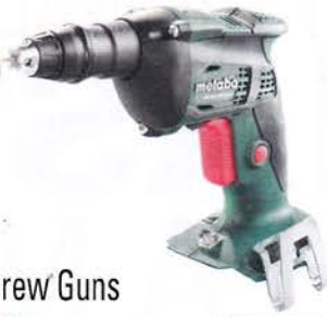
18v Screw Guns

620047890 SE 18 LTX 2500 SK 620048890 SE 18 LTX 4000 SK 620049510 SE 18 LTX 6000 SK