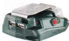
18v USB Charger