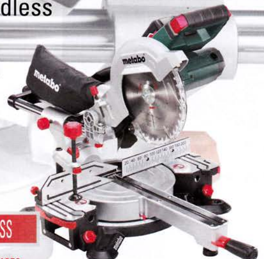
18 Volt Cordless Sliding Compound Mitre Saw