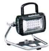
LED Site Light