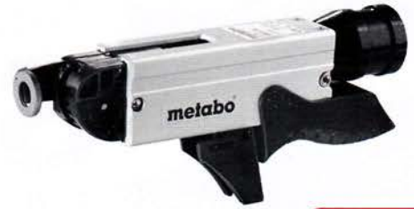
55mm Screw Magazine

SM 5-55 631618000 • Compatible with most major brands of screw ribbons, from 5 upto 55mm