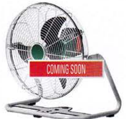
18 VOLT CORDLESS 3 SPEED FAN