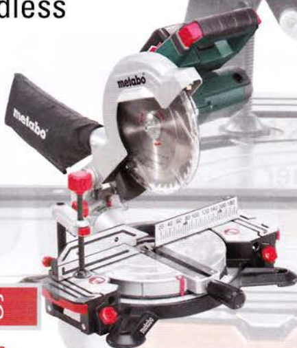
18 Volt Cordless Mitre Saw