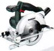
Ø165 mm Circular Saw