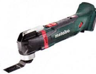
18 VOLT CORDLESS MULTI TOOL