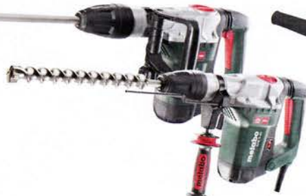
NEW SDS MAX HAMMERS