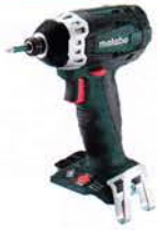
Hex Impact Driver