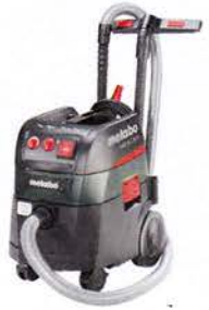
NEW 2015 MODEL VAC WITH AUTO CLEAN