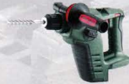
2 Mode SDS Plus Rotary Hammer