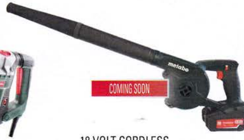
18 VOLT CORDLESS VARIABLE SPEED BLOWER