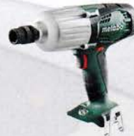
High Torque Wrench