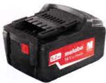
5.2 AH Battery