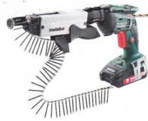
18 VOLT CORDLESS SCREW GUN & MAGAZINE