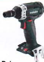
Square Drive Impact Wrench