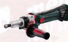
High Torque Die Grinder