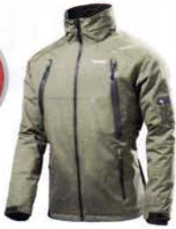
18v Heated Jacket

Med. 657009000 Large. 657010000 XL. 657011000 XXL. 657012000 XXXL. 657013000 HJA 14.4-18