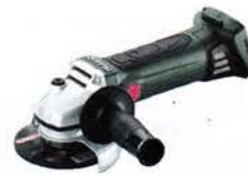
Ø125mm Angle Grinder