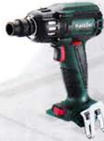
High Torque Wrench