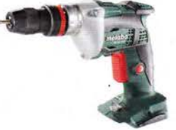
18 VOLT CORDLESS HIGH SPEED DRILL