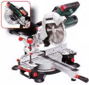
18 VOLT CORDLESS MITRE SAWS